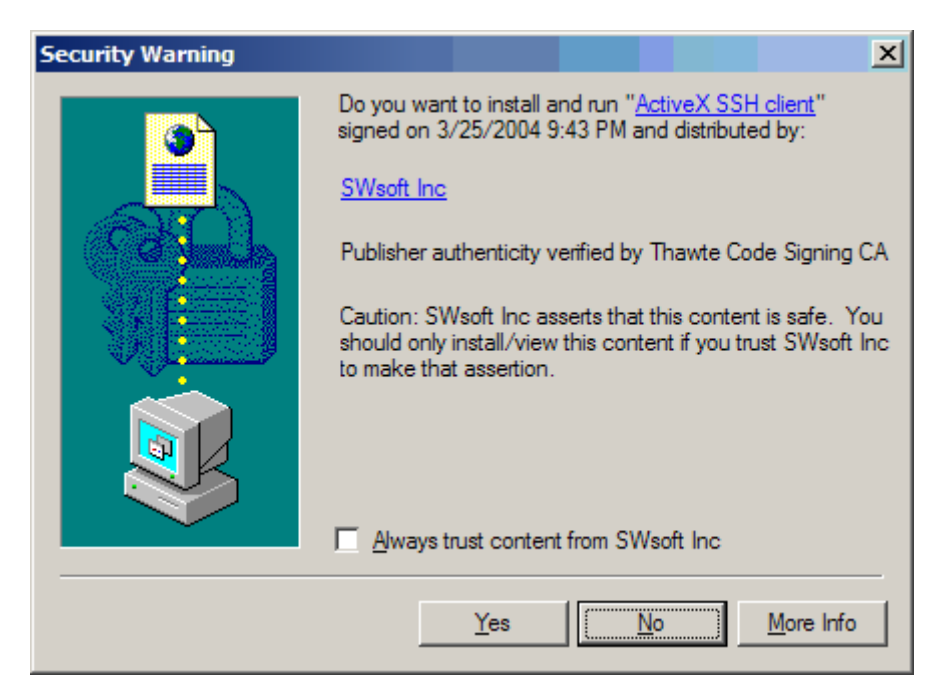
Figure 4: Installing Remote Desktop ActiveX Control

After you have filled in these two fields, click the Login button. If you are doing this for the first time, your browser may display a window like this asking you to install additional components: